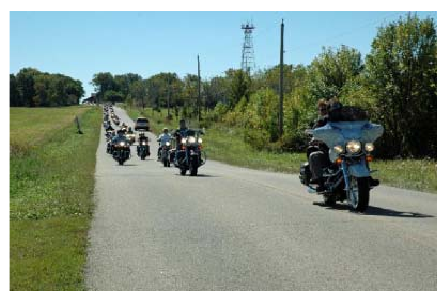
2007 Big Cat Ride above, 2007 Door County Ride below