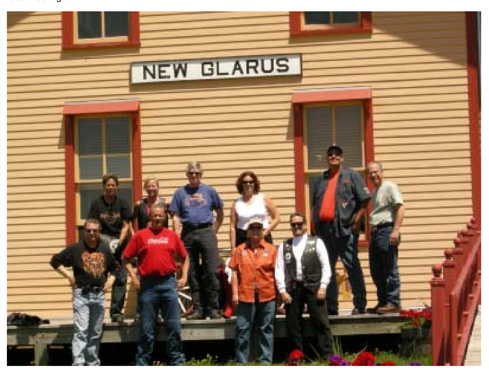
New Glarus, June 2007