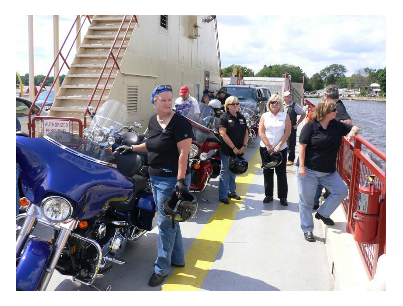
2007 Wheels N' Water Ride above, 2007 Hogs N' Dogs Ride below