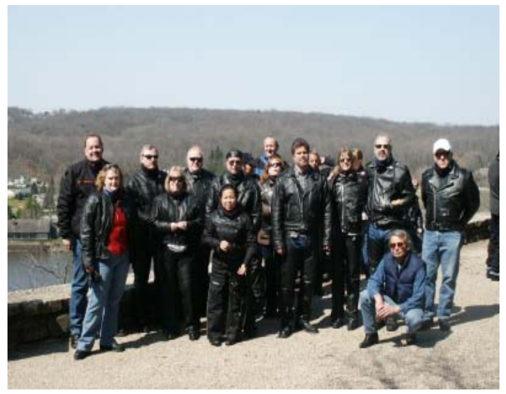
Kick Off Ride, April 24, 2007

Contact any Senior Road Captain or Road Captain for ride assistance or for information on becoming a Road Captain.