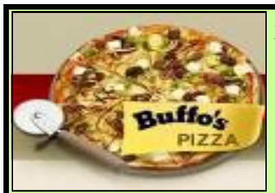
Take this coupon to Buffo's and get $5 off a large cheese pizza!

Compliments of Top Cat's own Lenny Innocenzi! Buffo's Italian-American Restaurant 431 Sheridan Road Highwood, Illinois 60040 847-432-0301