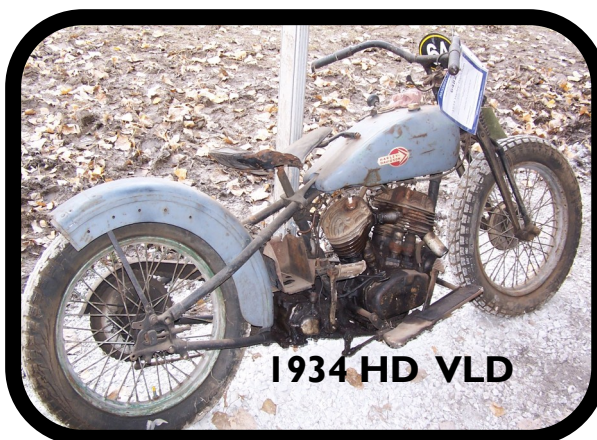
1934 HD VLD

Nothing in the collection was restored, but had been stacked/crammed in numerous outbuildings and a very large “pole” barn on the property. Something collectors call a real “barn find”. The auction company pulled, precisely categorized, and displayed everything in large white tents which included a huge seating area with large viewing screens where the actual auction was conducted.