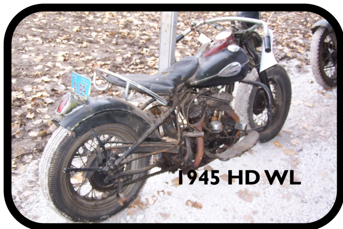
1945 HD WL

It was possible to participate in the auction in person, over the telephone, or on-line. I chose to participate on-line since the motorcycles were auctioned at the end of a long eight hour day on Friday. Needless to say, my single maximum bid on the 1915 HD Two Speed was immediately far exceeded as the bidding opened at 20,000.00. It sold minutes later for 57,500.00. So as not to embarrass myself or TopCats of Illinois who recognize me as a member, I won't give up my maximum bid...ever!