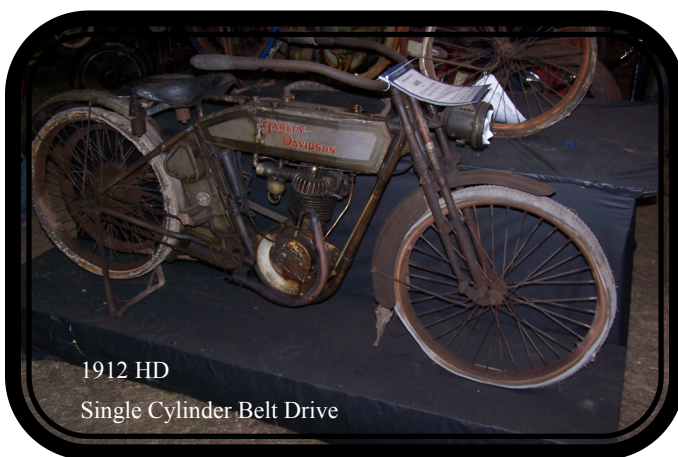
1912 HD Single Cylinder Belt Drive