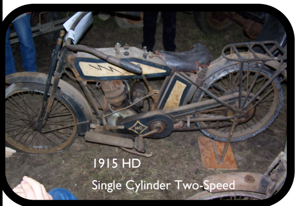
1915 HD Single Cylinder Two-Speed