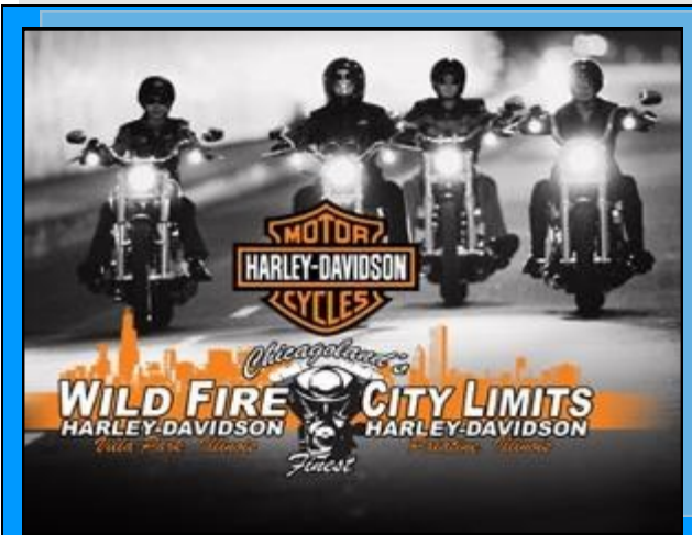
Top Cats Get 20% Off Certain Parts and Merchandise at City Limits Harley-Davidson