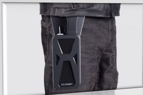
MiClimate is designed to keep motorcyclists cool in hot weather and warm in cold without risking their safety.

Being exposed to the elements as they are, riders face the prospect of sweating through hot days under their leathers, or shivering as frigid winds blow on cold ones. There are some heating and cooling options out there, as well as air-conditioning units designed specifically for motorbikes, but not everyone is keen to strap one of these to the back of their bike. Enter MiClimate, a belt designed to keep bikers at a comfortable temperature without adding too much bulk.