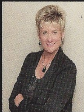
CEO / Team Leader