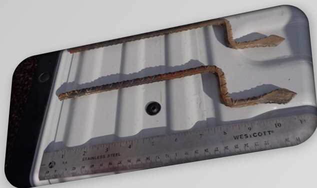
This photo, courtesy of the Arizona Game and Fish Department, shows a booby trap that was found in 2014.