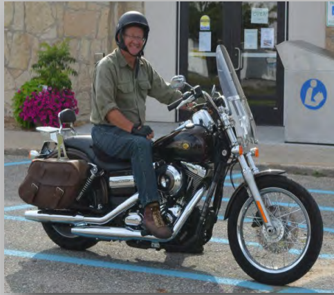
Senator Gary Peters

Sen. Peters explains, "I've loved motorcycles since I was a kid, and I started a newspaper route to buy my first motorcycle at age 11. To this day, I believe there is no better way to see Michigan's beautiful scenery than by bike, whether I'm riding to meet with constituents and small