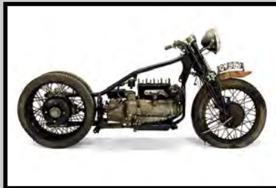
1932 Brough Superior 800cc model BS4 project $425,000

One of only seven survivors out of a production run of 10, this particular example was owned by Hubert Chantrey and it's believed he rode it during the Land's End Trial in 1932. The bike, which has two wheels at the back, is powered by the 747cc four-cylinder engine from the Austin Seven, but Brough bored it out to 797cc after initial tests on the first prototype revealed the 13bhp from the standard engine to be insufficient.