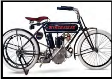
1910 Winchester 6 HP $580,000

Only 200 Winchester 6HPs were built by the Edwin F. Merry Company between 1909 and 1911, and this example, which sold at auction in