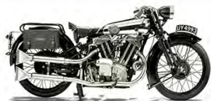
1929 Brough Superior SS100 'Alpine Grand Sports' $419,100

One of only seven survivors out of a production run of 10, this particular example was owned by Hubert Chantrey and it's believed he rode it during the Land's End Trial in 1932. The bike, which has two wheels at the back, is powered by the 747cc four-cylinder engine from the Austin Seven, but Brough bored it out to 797cc after initial tests on the first prototype revealed the 13bhp from the standard engine to be insufficient.