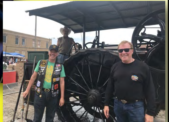
Mendota Sweet Corn Festival