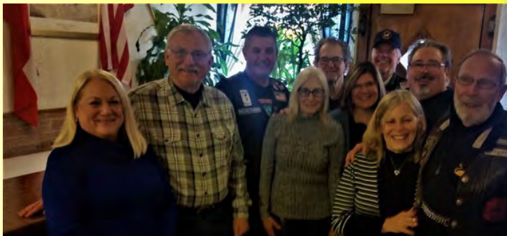
Toys for Tots