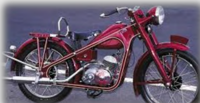
1949 Honda Dream

Meanwhile, some motorcycle games that we can play: