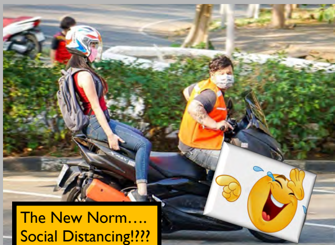
The New Norm... Social Distancing!???

The windscreen's electrically adjustable, and the cockpit holds a car-style 7-inch TFT dash too, with Apple CarPlay, cruise control, navigation, heated seats and grips, and more. When you're in the market for a premium bike, you're obviously going to want the top of the range, and that would be this Tour Airbag Automatic version, which comes complete with Honda's world-leading DCT seven-speed semi-automatic gearbox, ABS, airbag technology, fog lights, and more.