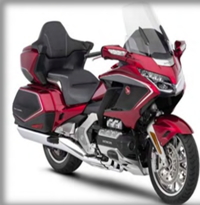
Honda Gold Wing Tour Airbag Automatic DCT: $32,300

The cockpit holds the upgraded Ride Command system with a 7-inch touchscreen featuring turn-by-turn navigation, customizable rider info screens, Bluetooth, and traffic and weather overlays. Also standard is the 600W PowerBand Audio Plus system, full LED lighting, a two-up touring seat with heating for rider and passenger, armrests, heated grips, and a power-adjustable flare windscreen, as well as ABS, keyless ignition, and more than 37 gallons of storage space. And, it's still a limited-edition model.