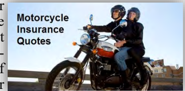
Motorcycle Insurance Quotes

Even if your existing car insurer offers motorcycle coverage, get a quote but keep looking. Giving yourself more options is one of the best ways to lower your insurance costs.