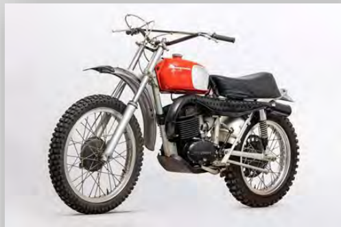
Steve McQueen's Husqvarna 400 Cross sells at auction for $186,500

A 1970s Husqvarna motocross bike owned by The Great Escape star Steve McQueen has sold for $186,500 (£157,919) at an auction in California.