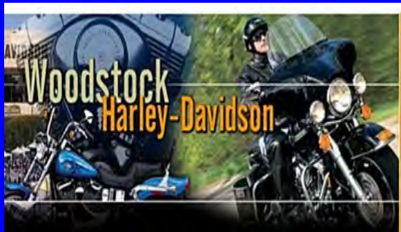
Woodstock HD and Staff Support