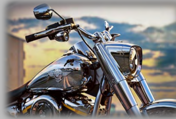
Harley-Davidson Gray Ghost front end

Harley-Davidson lifted the lid on the fifth model in their growing Icons Collection – using the launch to showcase a super shiny surface finish